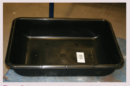
Figure 5 A concrete mixing tray available at a local hardware store makes a good litter box. This one is made of heavy plastic, with a smooth surface and adequate depth and size (24 x 36 x 8 inches).