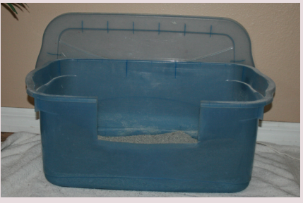
Figure 4 A storage container with the side cut down for easy entry makes a good litter box. The low entry will facilitate use by an older cat or one with degenerative joint disease. Note placement of the lid behind the box to protect the wall.